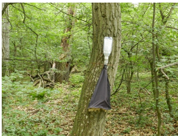
Fig.3 Tree photoeclector installed in the ecotone