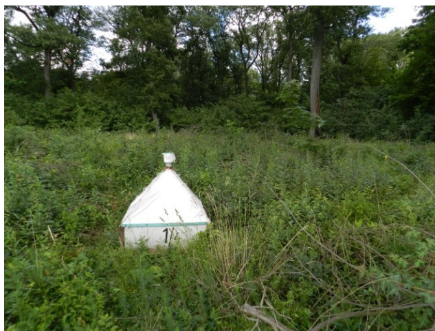
Fig.2 Soil photoeclector exposed in the clearing close to the forest